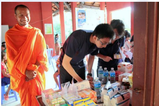
Peering at the dispensary drugs...

Into its 2 nd year of conception, students from the Catholic Medical Society journeyed to Battambang Prefecture, Cambodia, to provide medical assistance and health and values education to the congregation.